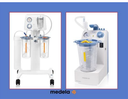
How to use a manual suction device. How long can you suction a patient's airway.